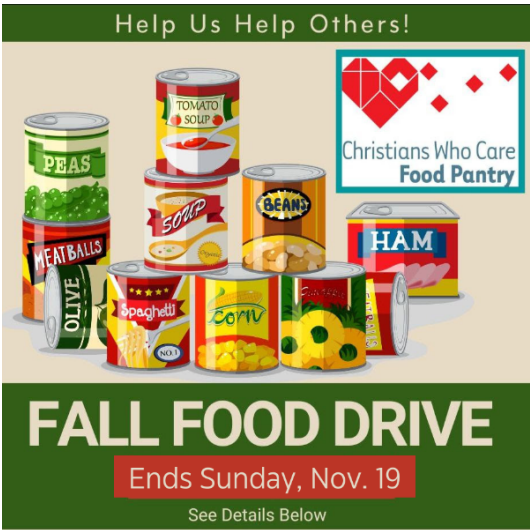
Please help us feed our neighbors!